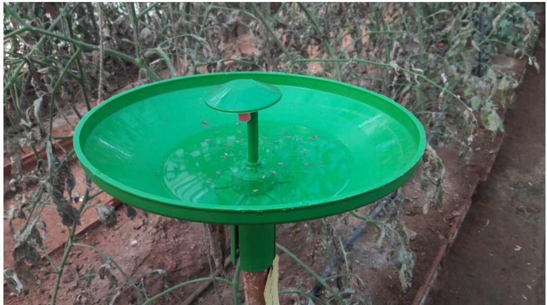
Fig. 5: Tuta absoluta adults trapped in pheromone traps