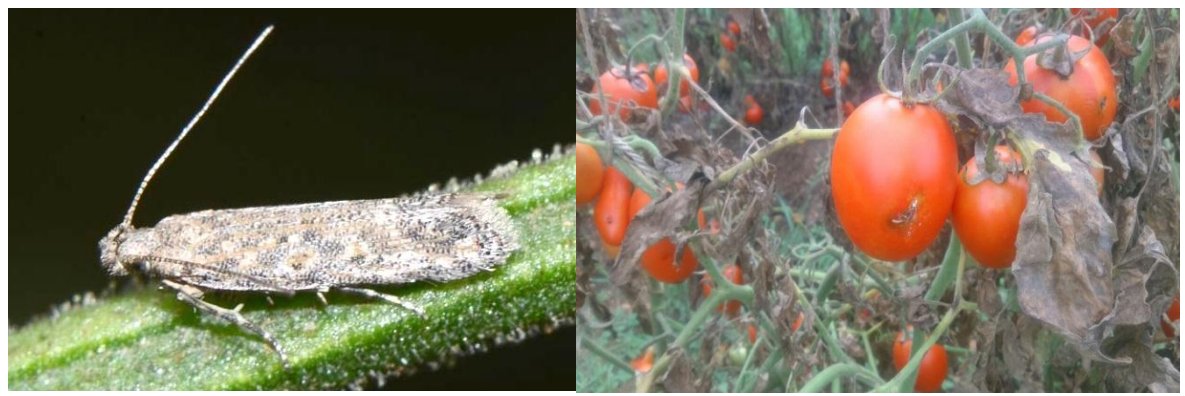
Fig. 3: Tuta absoluta adults

Fig. 2: Season wise Tuta absoluta catches